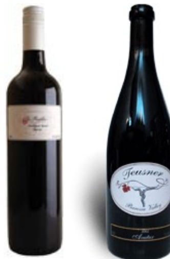
Teusner Riebke shiraz (left) and Joshua grenache/mataro/shiraz