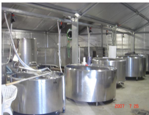
The fermenting tanks

One of my finds in my trip through South Australia was Maverick Wines. It took me ages to convince the boys to get them in, but here they are. I'm still working on getting the riesling in too as it has had amazing reviews too.